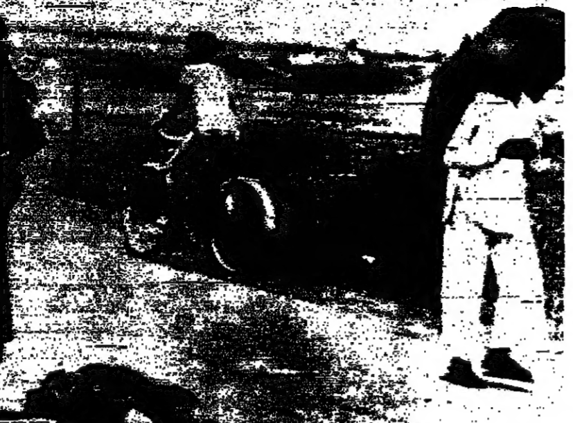
Body of a Vietnamese lies on road seven kilometres north of Hue. He was killed during an attack on a South Vietnamese outpost guarding Route 1, main supply route for South Vietnamese troops guarding the northern border.